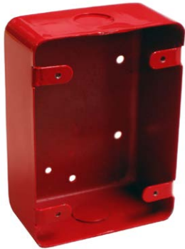
MRM-700 Surface Mount Backbox