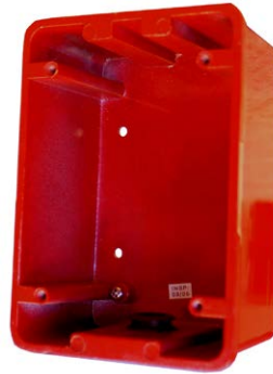
MRM-700WP Weatherproof Surface Mount Backbox